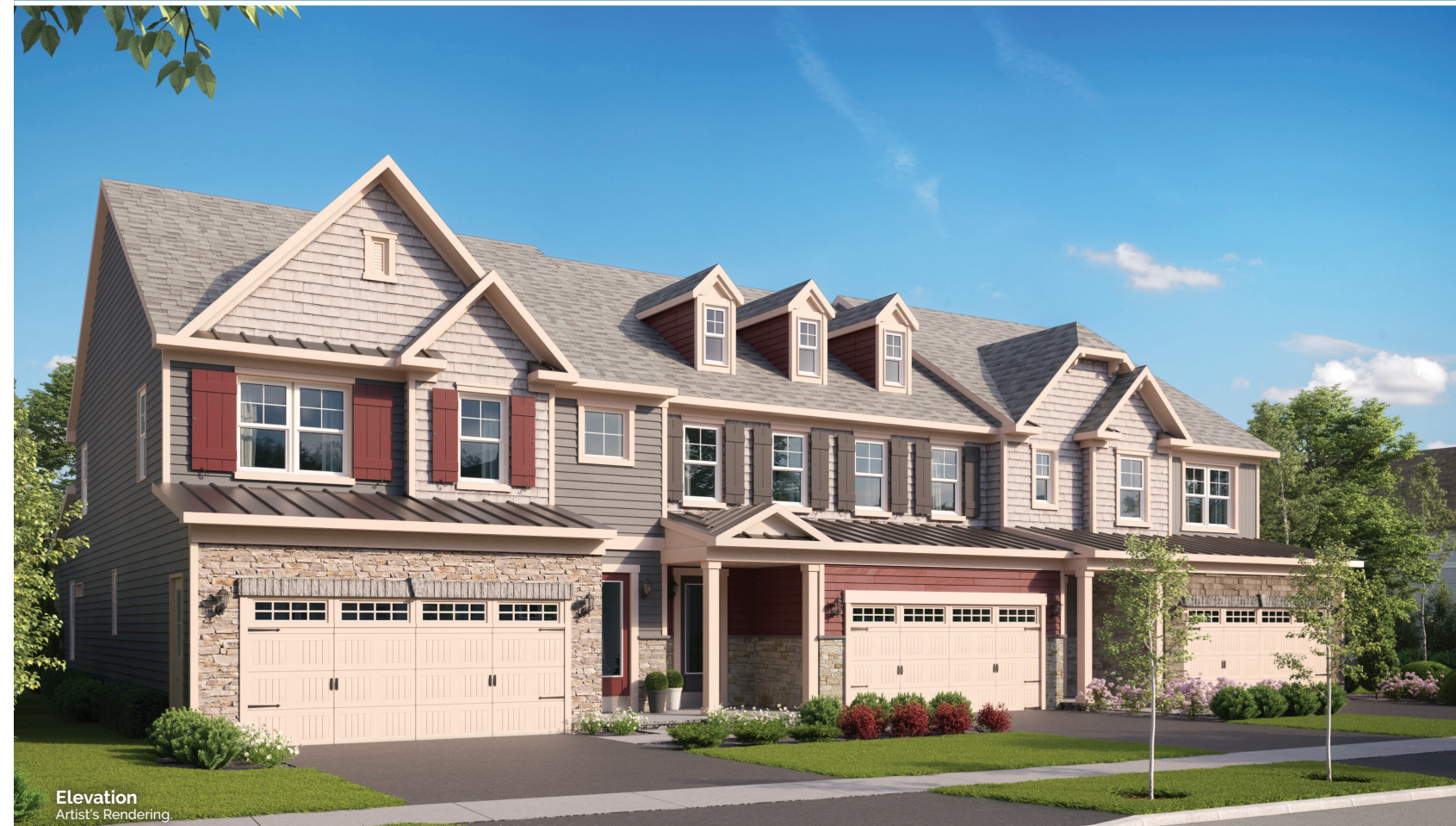
Elevation Artist's Rendering