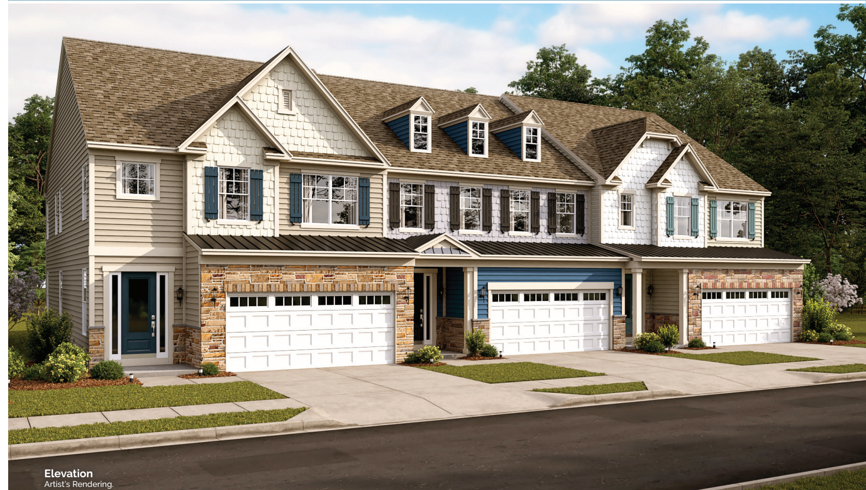
Elevation Artist's Rendering.

OFFERED BY K. Hovnanian Homes of Maryland, L.L.C.